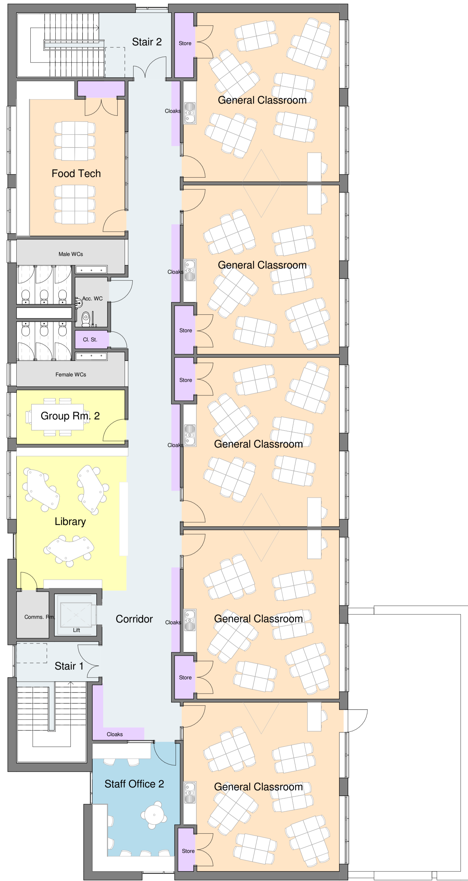
First Floor 1 : 100